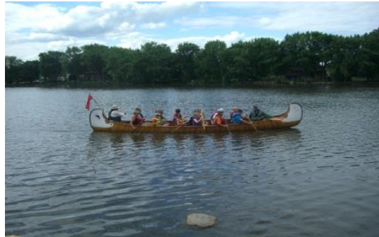
28' Northwest Fur Company Canoe

Ashippun Town Hall 6 miles south of Hwy. 60 6 miles north of Hwy. 16 Corner of Co. Hwy. O & P Ashippun, WI 53003