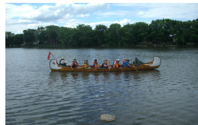
28' Northwest Fur Company. Canoe

Ashippun Town Hall 6 miles south of Hwy. 60 6miles north of Hwy. 16 Corner of Co. Hwy. O & P Ashippun, WI 53003