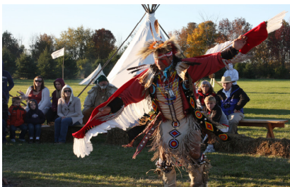
Buffalo Big Mountain

Period & Native Traders, Horse Drawn Carriage, Black Smith, Flint Knapper, Face Painting, Trapper, Gatling Gun Demos, Cannons, Indian Artifact Display, Period Food, (Fry Bread, Buffalo Burgers, Timberline Chili, Mountain Man BBQ, Kettle Korn), and Many Other Events on Going All 3 Days